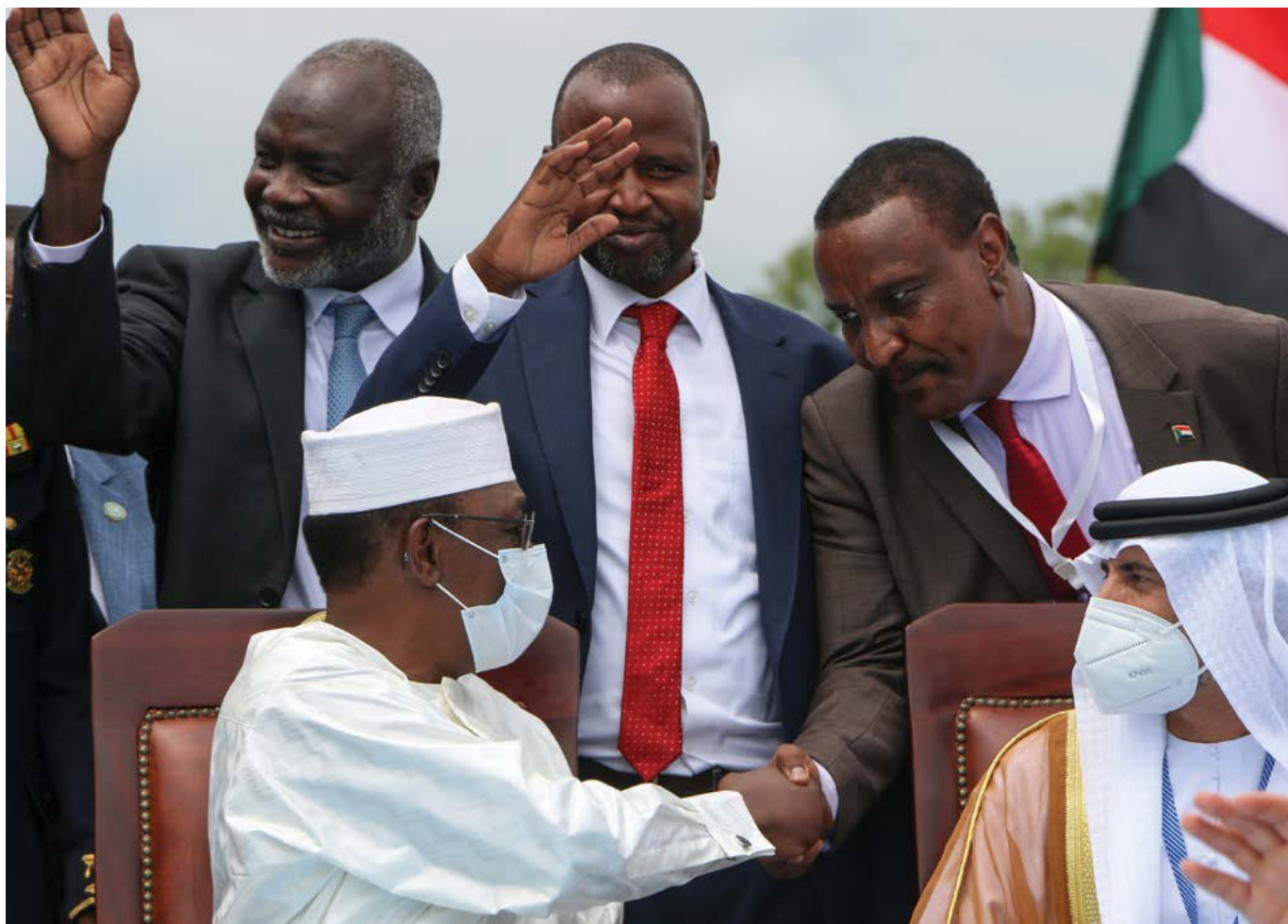
Yasir Said Arman of the SPLM-North shakes hands with then Chadian president Idriss Déby, as representatives of Darfur rebel groups look on, at the Juba agreement signing ceremony on October 3, 2020.

other's rebels. Ongoing tensions may trigger a border war between the two countries and, together with Addis Ababa's intransigence on the dam, push Khartoum to lean closer to Cairo. A low-level border war may also be a way for SAF generals to garner support domestically. Hemetti seems reluctant to engage in such a war or to side with Egypt or the TPLF against Ethiopia and its Eritrean ally.