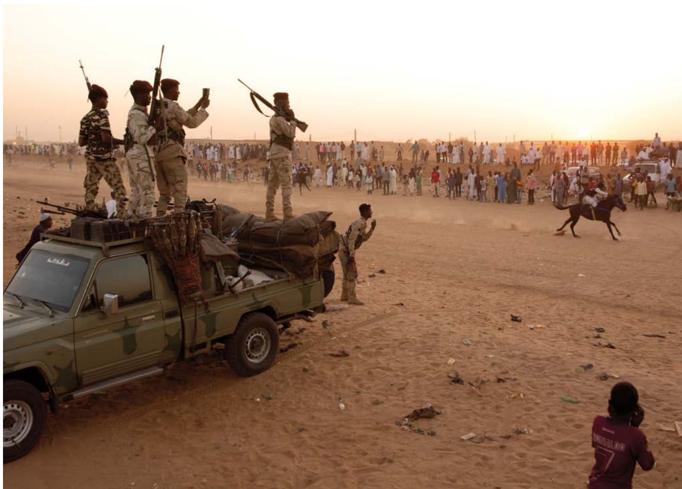
Rapid Support Forces soldiers watch at a horse race in El-Fasher, North Darfur, in February 2022, won by a horse belonging to the state's RSF commander.

As expected, the rebels remained close to Hemetti. But as they went back to Khartoum, they also attempted to diversify their alliances and expressed continued differences of opinion over who to ally with, including in the event of tensions between the RSF, the SAF, and the FFC. Isolated within the SRF because of its leaders' Islamist backgrounds, the JEM openly attempted to transform into a political party that could gather the remnants of the divided Islamic movement and eventually act as their entry point into a government from which they were excluded. Ultimately, in September 2021, the JEM and the SLA-MM reunited, purporting to form a second FFC (sometimes known as FFC2, or the FFC National Charter) opposed to the political parties and rejecting Hamdok's attempts to reunite the FFC. This move arguably paved the way for their further alliance with Hemetti and the SAF and for the coup.