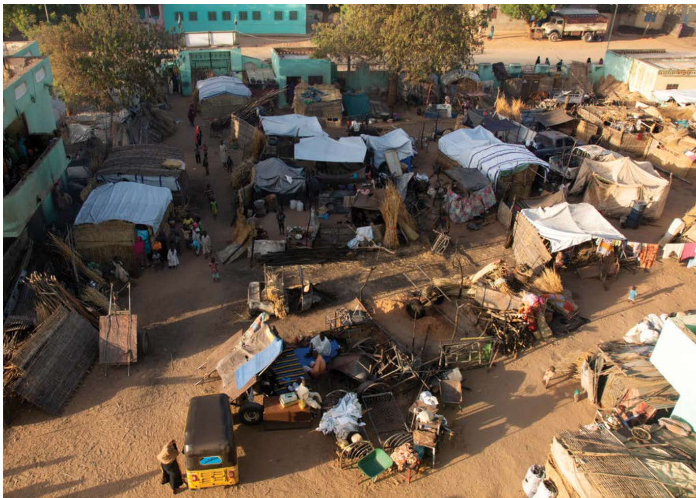
After the attack by Arab militias on the Kirinding IDP camp in January 2021, about 100,000 Masalit took refuge in more than 80 gathering sites, such as this one on the grounds of the state ministry of education, in El-Geneina.

Other violent attacks took place in South Darfur, including clashes between Arab and Arabized Fellata militias in January and June 2021, resulting in 72 and at least 36 deaths, respectively. 8 In North Darfur, since August 2021, Rizeigat Arab militias opposed to the peace agreement have attacked Zaghawa IDPs returning to farm in Tawila locality, displacing 35,000.