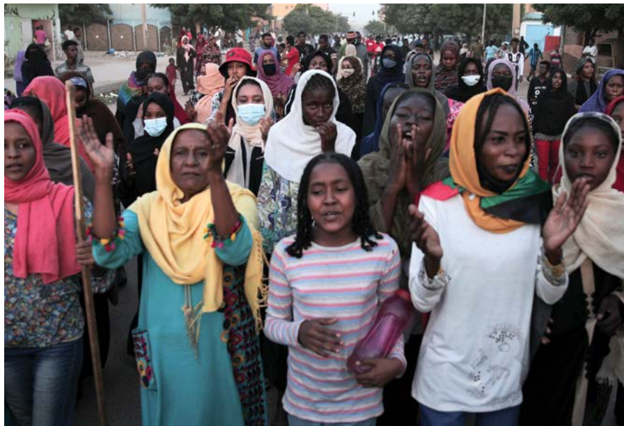
People protest in the streets of Khartoum on October 27, 2021, following the military's overthrow of Sudan's transitional civilian government