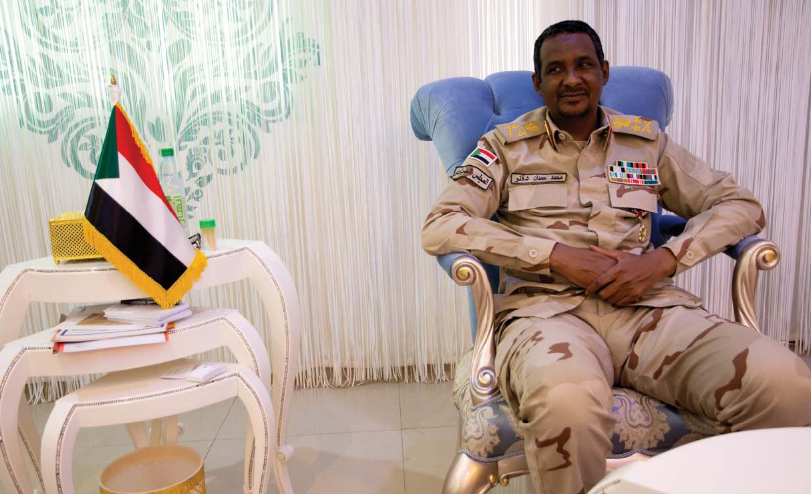
Mohamed Hamdan Daglo—more commonly known as Hemetti—poses for a photograph at his villa in Khartoum on September 30, 2020.