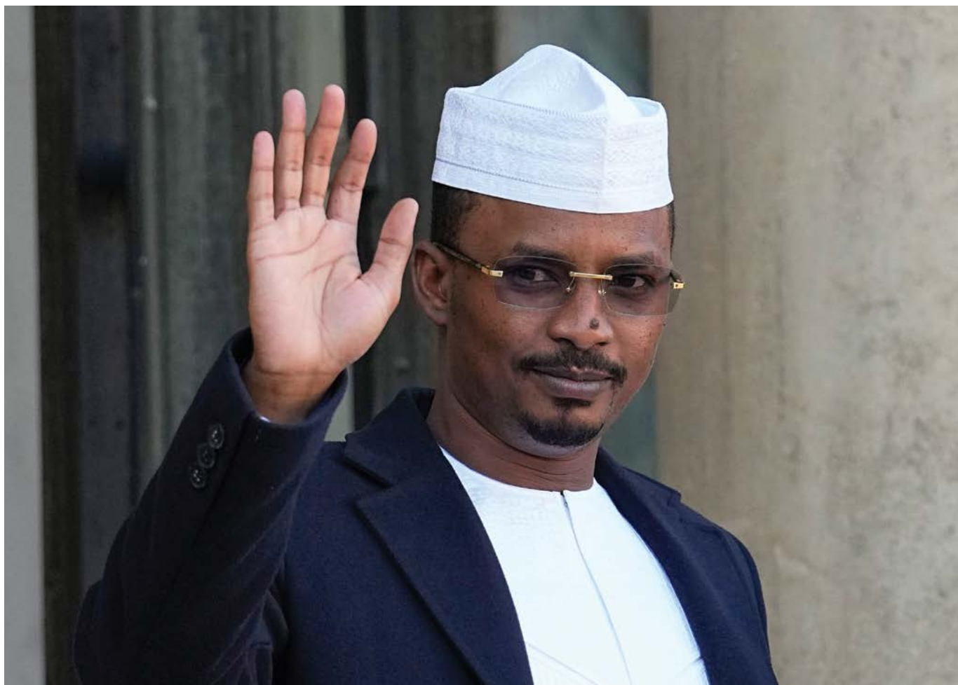
General Mahamat “Kaka” Idriss Déby, shown here at a meeting with French president Emmanuel Macron in Paris on November 12, 2021, became the leader of Chad’s Transitional Military Council (and de facto leader of the country) following the death of his father, President Idriss Déby, in April 2021.

In March 2019, when the UFR conducted a raid from Libya into northern Chad, the Chadian army, with mostly Zaghawa officers, refused to fight. Déby then called Paris for help and the UFR column was annihilated by French jets. France remained Déby’s unwavering shield, if one believes an anonymous French official’s declaration in June 2019: “If tomorrow Boko Haram attacks from Lake Chad or a group of janjawid militias tumbles from Sudan, we will very certainly lend [Déby] a hand again.” 25 During the April 2021 attack by the (non-Zaghawa) Front for Change and Concord in Chad, presumably because the Chadian army appeared more mobilized, France reportedly limited its intervention to nonaggressive overflights of the rebels but still provided intelligence and logistical support to the army.